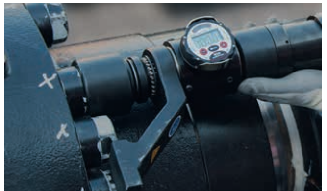
Torque Control in action

Torque Control is available in three different construction sizes and covers a measurement range of 110-5,500 Nm. The devices are compatible with the current Plarad rotating screwdriver program and are virtually maintenance-free. The calibration cycle is determined by the utilisation percentage and the frequency of use.