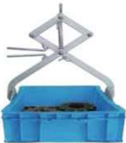
■ Pantagraph Type