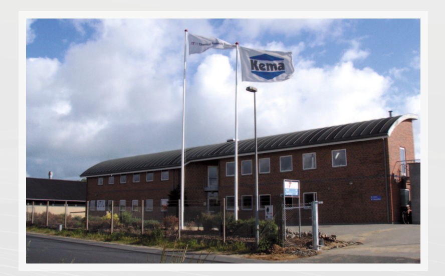
Kema® . Priorsvej 36 . DK-8600 Silkeborg

Article no.: 49002400, 85 g / 49002410, 500 g / 49002420, 5 kg