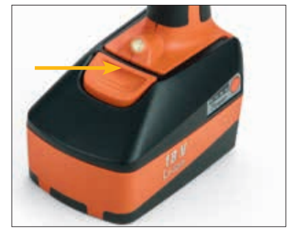
Including two 5.0 Ah Li-lon batteries

The LED serves as an active indicator of the battery capacity.