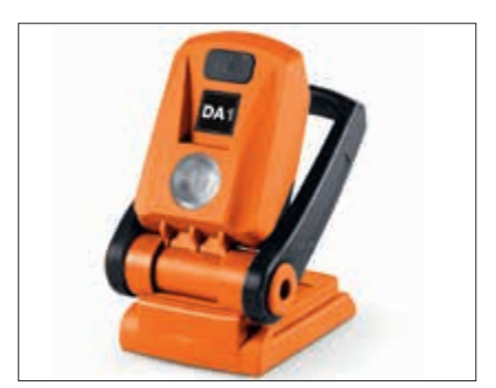
Optional LED working lamp Very bright at 900 lux, compatible with all DA1 batteries.