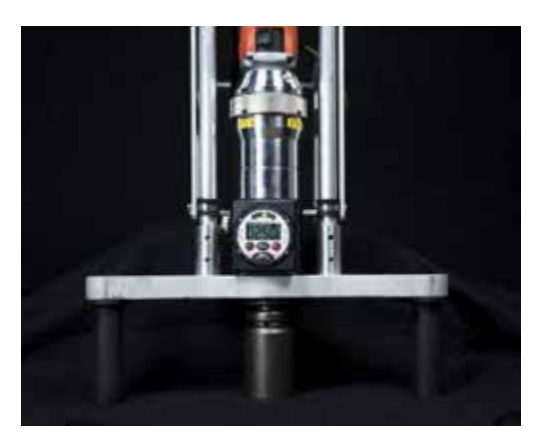
Mounted Torque Control TC1

The applied torque is visible directly on the sensor display. An additional target value can be defined. If the given tolerance is exceeded, the device will initiate an audible alarm. The operator will receive visual information regarding the applied torque pressure result on a display with LED traffic light colors. This feature is particularly useful when working in a loud environment.